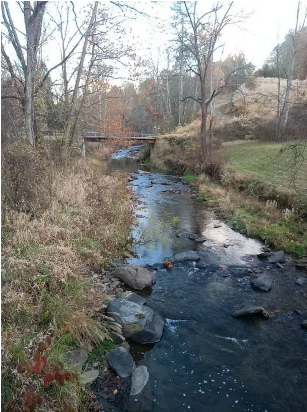
Date & Time: November 5, 2025 5:23 PM Location: 35.801862, -82.529833 Photo Direction: East